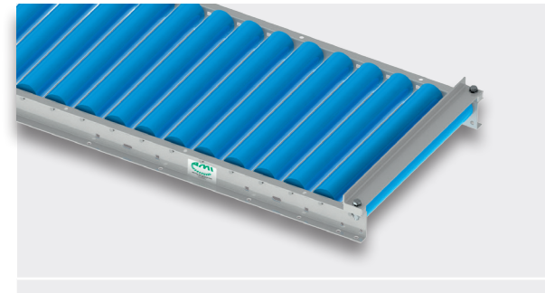
End stop angle 40 x 20 galvanised steel