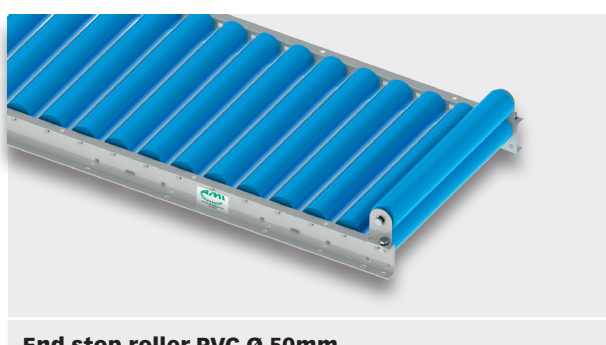
End stop roller PVC Ø 50mm

Height: 63 mm above the top edge of the profile